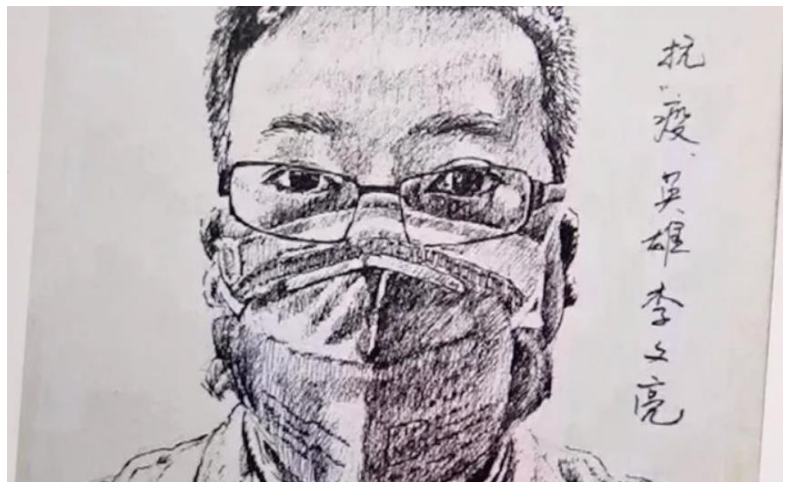
Chinese whistleblower Li Wenliang who issued an early warning that was suppressed by government authorities

The SARS-CoV-2 outbreak could have been contained early on and the vast majority of what followed could have been prevented. This did not happen explicitly because of false and fatal governmental as well as WHO guidance in the early months of the coronavirus outbreak (which probably started in Wuhan in September 2019). This also explicitly did not happen because Chinese government authorities stifled free speech, censoring any attempts of frontline hospital physicians in Wuhan to warn the world about what they saw as severe SARS-like symptoms in their patients in late 2019. Whistleblowers like Dr. Li Wenliang and his colleagues were arrested. As one op-ed in The Guardian (2020: 1) put it: “If China valued free speech, there would be no coronavirus crisis.”