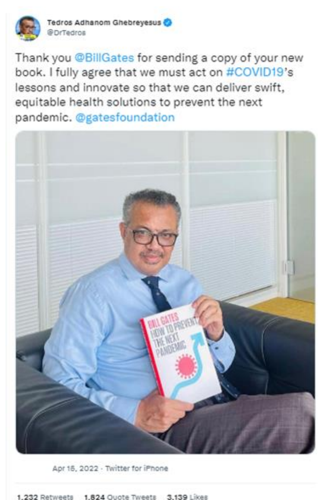
WHO Director-General Tedros Adhanom Ghebreyesus poses in support of Bill Gates' new book on Twitter.

Since funds now come with caveats, the organization is compromised on a number of issues that involve the interests of its donors. The private sector and also most state