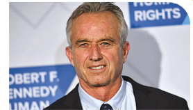
Robert F. Kennedy Jr. Chairman of Children's Health Defense

In a letter to the UK's Joint Committee on Vaccines and Immunisation, more than 30 politicians, doctors and medical experts said long-term effects from Covid vaccines could compromise the life expectancy of the country's children. [Jan 2022] https://childrenshealthdefense.org/defender/myocarditis-uk-regulators-reassess-covid-vaccines-children/?itm_term=home